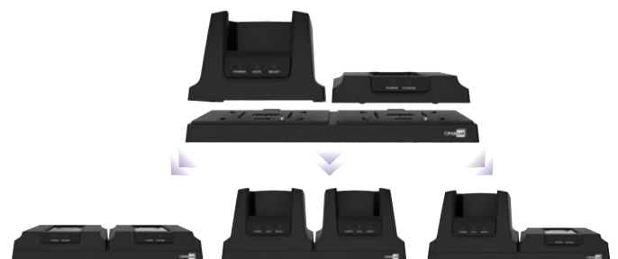
Modular Charging and Communication System

The 8600 series' flexible design comes with swappable keypads which give the 8600 series the power to easily swap between 29 or 39 keys when it is necessary. The 8600 series also comes equipped with a modular system which provides various combinations of charging / communication cradles and battery chargers. This makes the initial configuration modification very simple. This flexible design will also assist in reducing the inventory level while providing more cost-effective re-configurations for end users. Additionally, it will also make repair and replacement process easier and quicker.